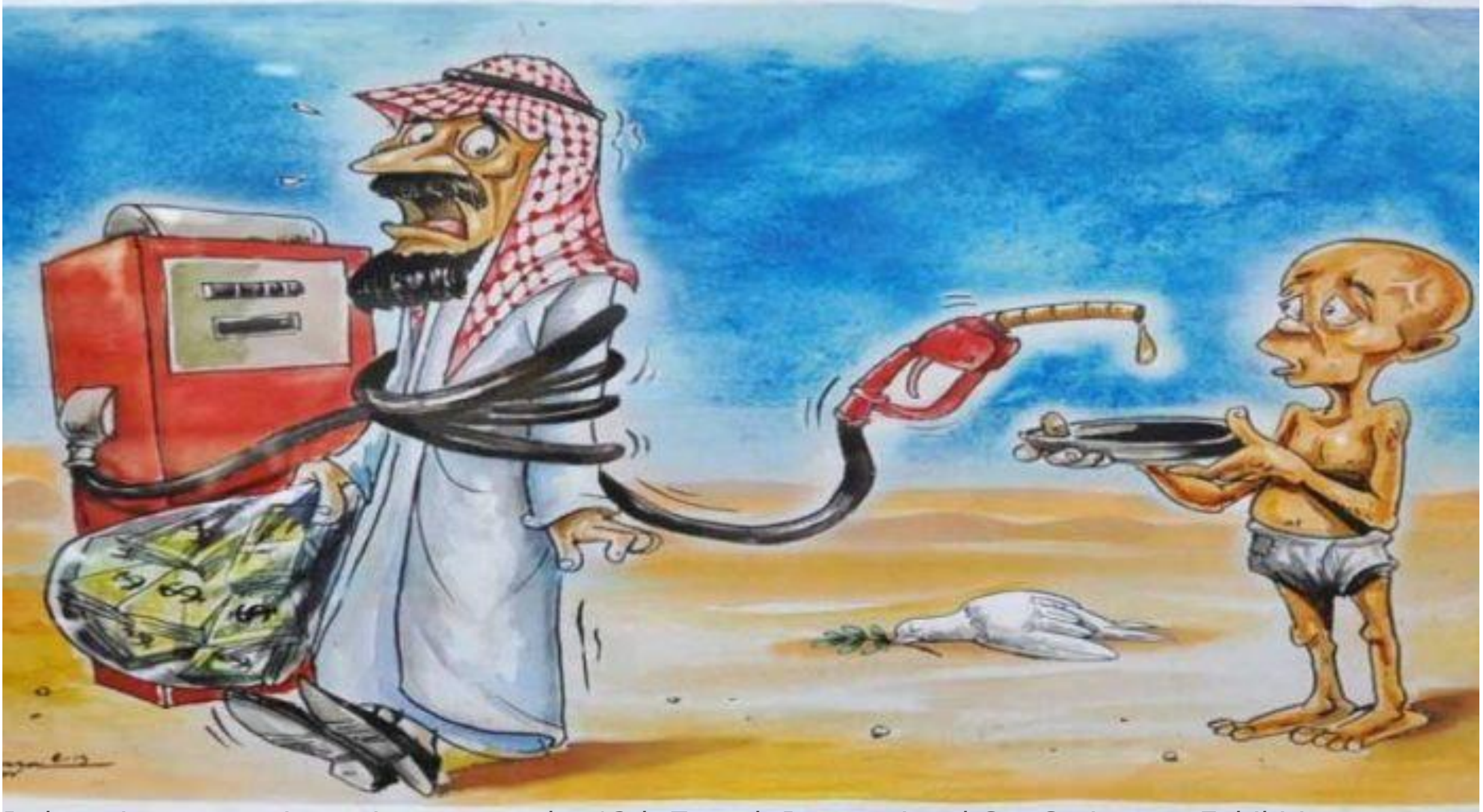
Indonesian cartoonist caricatures at the 13th Zagreb International Car Caricature Exhibition.